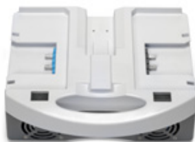
i-charge 9 (3 pieces)